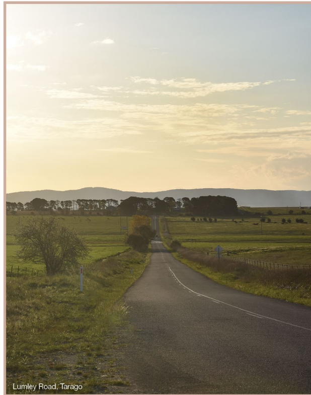
Front cover image: Bullamalita Road, Goulburn

Depart Goulburn, heading south along Braidwood Road, passing through Lake Bathurst to Tarago. Lake Bathurst is not accessible to the public and is not a typical "lake" as it is empty most months of the year but, in season is actually a wetland haven for wading birds. You will also find some astounding WWII fuel tanks hidden away in hills around Lake Bathurst. Once in Tarago you will find some stunning historic buildings dating back to the 1840s. As you depart Tarago, heading east along Lumley Road, you will turn right onto Cullulla Road and left onto Oallen Ford Road before arriving in the picturesque locality of Windellama. The trip north-west along Windellama Road takes you past Quialigo and the Goulburn Airport before arriving back in Goulburn.